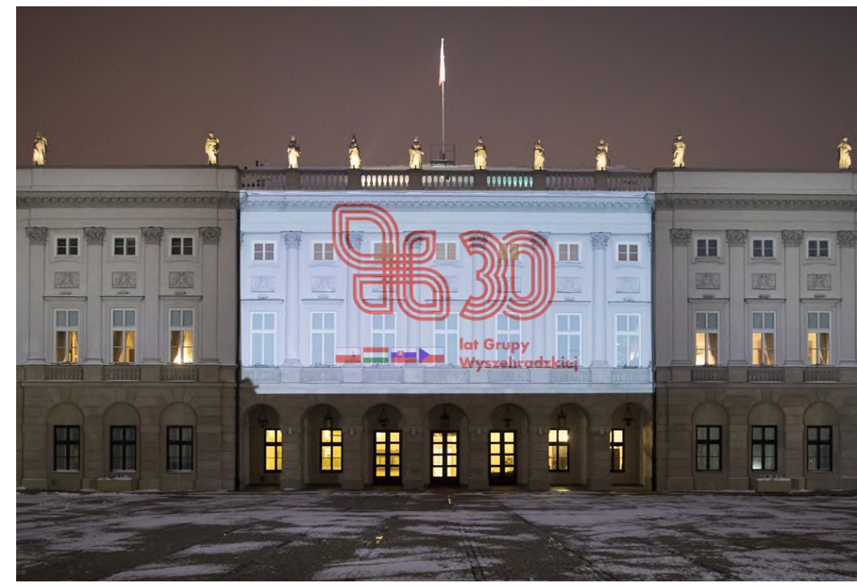
Festive illumination on the facade of the Presidential Palace in Warsaw.

The Presidents also unveiled a commemorative plaque to mark 30 years of cooperation within the Visegrad Group. In the evening, a festive illumination was displayed on the facade of the Presidential Palace in Warsaw.