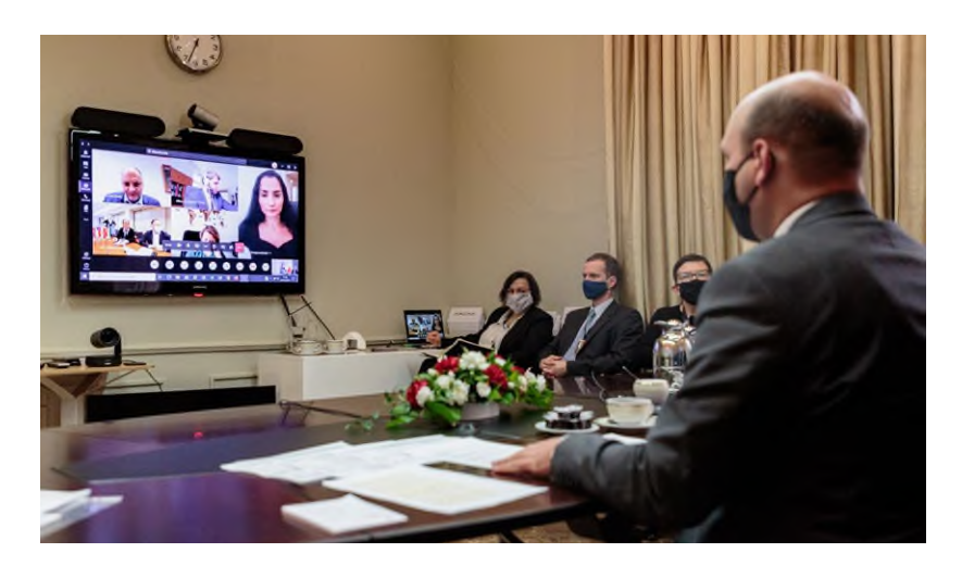
The meeting inaugurating the V4 Virtual Centre for COVID-19, 9 October 2020.

The Polish Presidency of the Visegrad Group in the field of health was summed up at the videoconference of health ministers of the V4 countries on 28 June 2021.