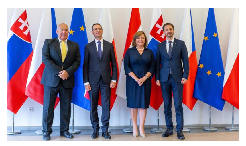
Meeting of V4 finance ministers, 4 September 2020

On 4 September 2020, the V4 Finance Ministers held a meeting in Warsaw. During the event, the ministers discussed efforts to tackle the negative economic outcomes of the COVID-19 pandemic, as well as the current economic challenges in Europe and cooperation in the area of VAT, including mobility of the digital market. Ministers pledged to cooperate in the region and to strengthen relations within the EU and on the international arena. The talks also covered the issues of global minimum taxation, combating tax fraud and fighting economic crime, especially with regard to income tax and VAT. Ministers also addressed the issue of greater effectiveness of EU anti-money laundering regulations, including the establishment of a new EU anti-money laundering supervisory centre in one of the V4 countries. They pointed out that joint efforts should be taken, among others, with regard to tax issues in the digital economy. These are priority issues given the serious role of the digital market in times of the pandemic and they require a model for administrative cooperation of V4 countries to be developed. At the end of the meeting, a declaration on continued economic cooperation was adopted, especially focusing on taxation of the digital economy sector and the exchange of international tax information.