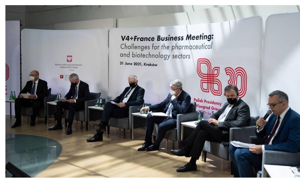
Meeting of ministers of the economy of the V4 countries and France, 21 June 2021.