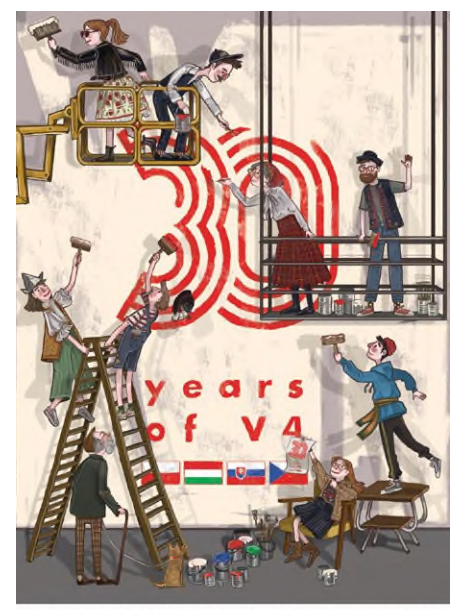
Mural powstał z okazji 30 tej rocznicy powstania Grusy Wyszahnadzkiej, z inicjatywy polakiej prezydencji w Grupie. Prezentowany jest w czterech stolicach państw tego ugrupowania. Bratysiawie, Budapeszcie, Pradze i Warszawie.