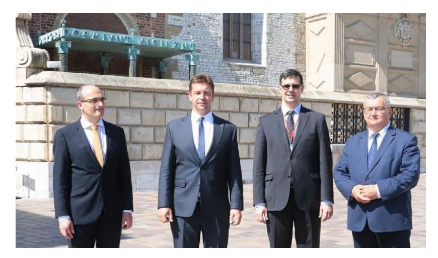
Meeting of V4 Transport Ministers, Kraków, 17–18 June 2021.

Joint transport projects were an important topic of the Polish Presidency in the context of joint implementation of infrastructural investments aiming at bridging the gap that still exists between the V4 and the Western European countries in this area, the planned application for CEF funds in the 2021–2027 EU financial framework, as well as the launch of the "military mobility" component and the revision of the TEN-T network.