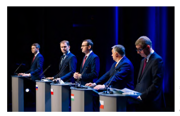
Summit of V4 Prime Ministers in Lublin, 11 September 2020