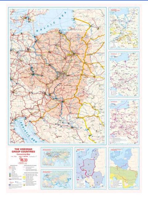
The infrastructural map of V4 countries prepared by the Centre for Eastern Studies (OSW) and Polkart Cartographical Publishing House for the Polish Ministry of Foreign Affairs