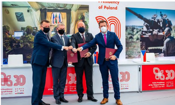
Meeting of V4 Defence Ministers, 20–21 June 2021.

Security cooperation was an important priority of the Polish Presidency of the Visegrad Group.