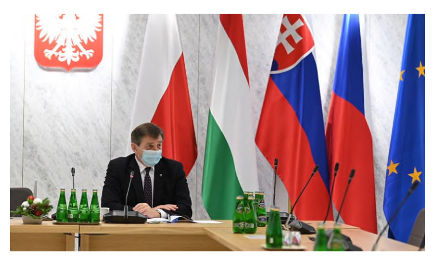
Videoconference of Chairpersons of Foreign Affairs Committees of V4 Parliaments

videoconference of the chairs of the committees on physical culture, sport and tourism of the V4 Parliaments, 22 June 2021.