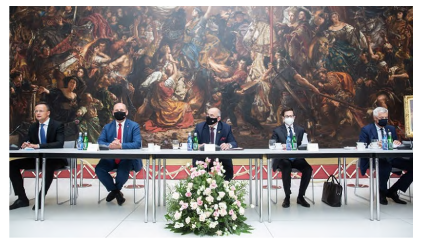
Meeting of the V4+Western Balkans foreign ministers, Poznań and Rogalin, 28 June 2021