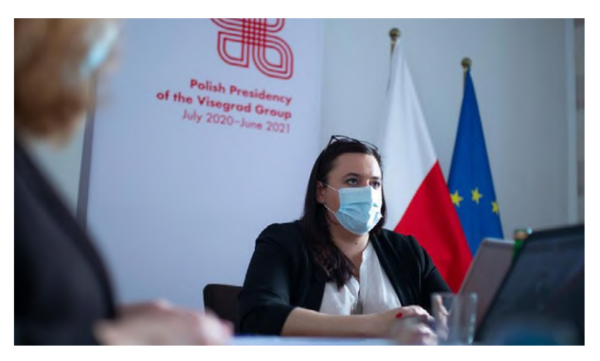
Videoconference of ministers responsible for cohesion policy in the V4+4 countries, 25 February 2021.

In the context of the work on the National Recovery Plans (NRPs), a videoconference of ministers responsible for cohesion policy in the V4+4 countries was held on 25 February 2021. During the meeting, ministers discussed one of the key elements of the anti-crisis package under NextGenerationEU, i.e. the Recovery and Resilience Facility and the National Recovery Plans designed for its implementation.