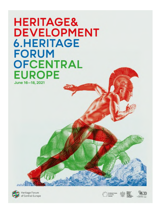
VI Central European Heritage Forum

and social inclusion, and concentrated on presenting new, actionable tools and policies that address the challenges currently faced by Central European societies.