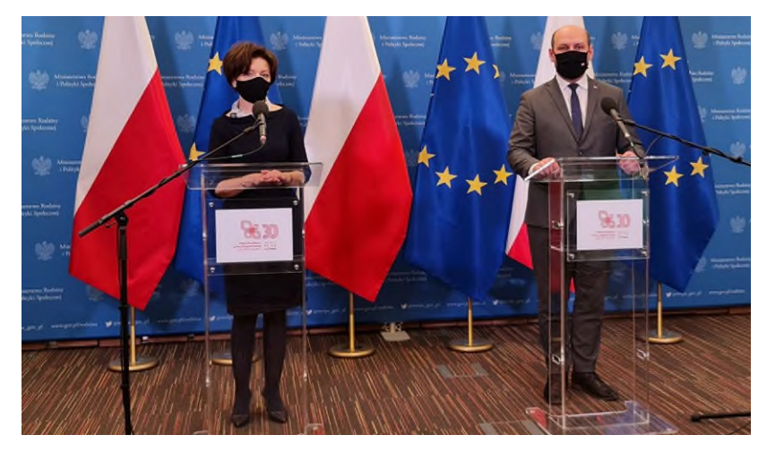
Videoconference of Ministers of Family and Social Affairs of the Visegrad Group, 18 February 2021.

The V4 countries also developed common positions on the work to amend the EU legislation on the coordination of social security systems, both at national level and through the permanent representations of the V4 countries to the European Union in Brussels.