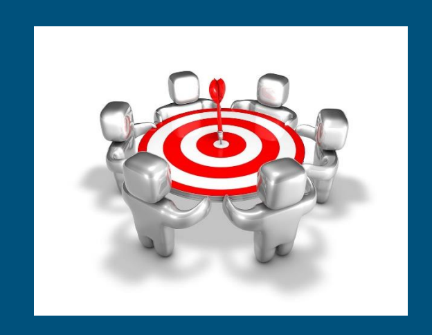
Taskforce Legal Entity Taskforce Certification Schemes Taskforce Harmonisation