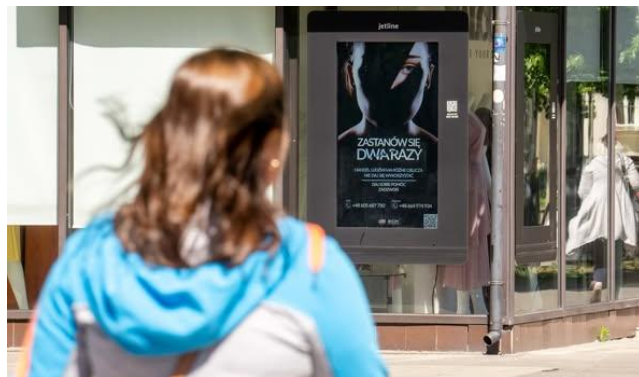
Awareness-Raising Campaigns on Trafficking Risks