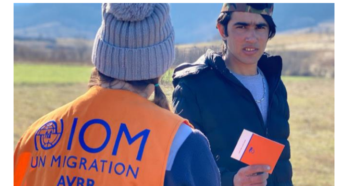
Support for victims with Assisted Voluntary Returns and Reintegration