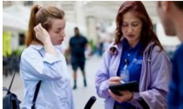
Referrals, Provision of information, Cultural Mediation and Legal Counselling