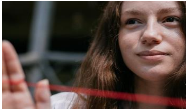
Protection Case Management, MHPSS