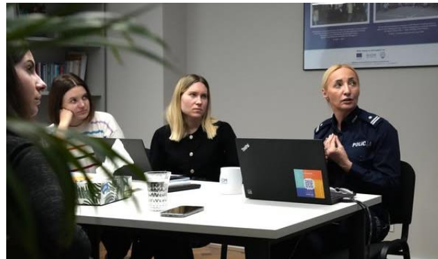
Capacity building for law enforcement and diplomatic personnel