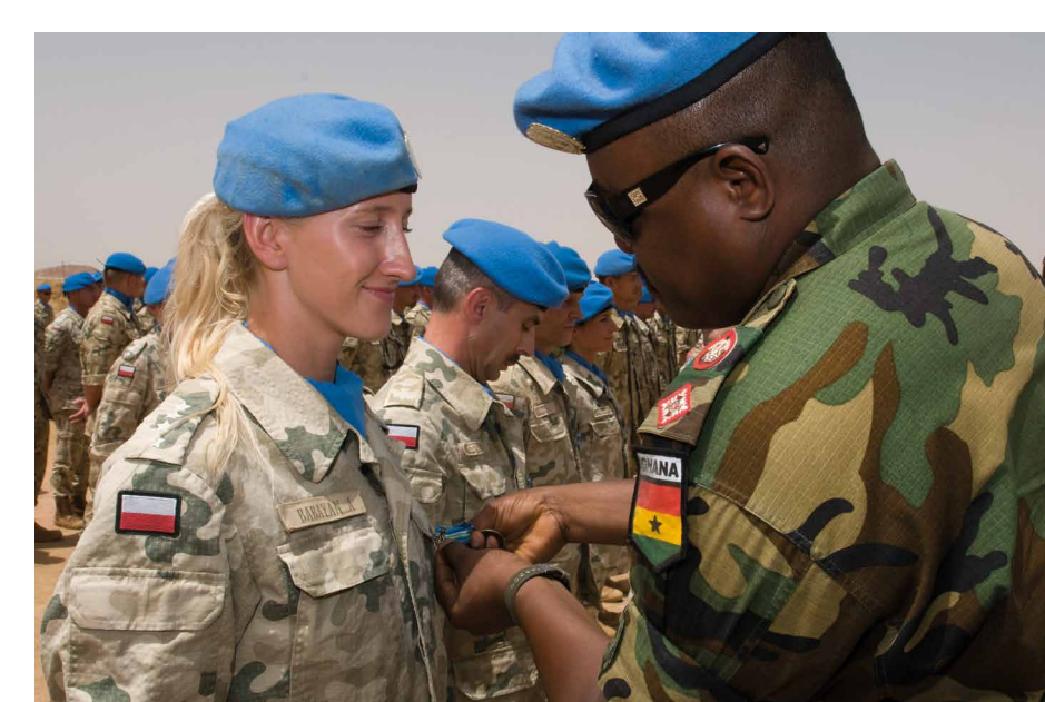
Medal award ceremony in Iriba, the UN mission MINURCAT in RCA and Chad.

Many women took part in the OSCE election observation missions (including in the Balkans, and in Ukraine)<sup>14</sup> and in the work of Polish humanitarian organizations in areas affected by armed conflicts. It is also worth noting