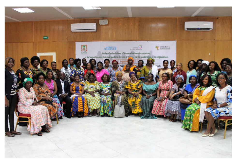
A workshop on constitution for women leaders in the Republic of Côte d'Ivoire, held as part of a UN Women project funded by Poland.

In 2017 Poland supported UN Women's actions in Cote d'Ivoire aimed at raising awareness on gender equality and women's rights.