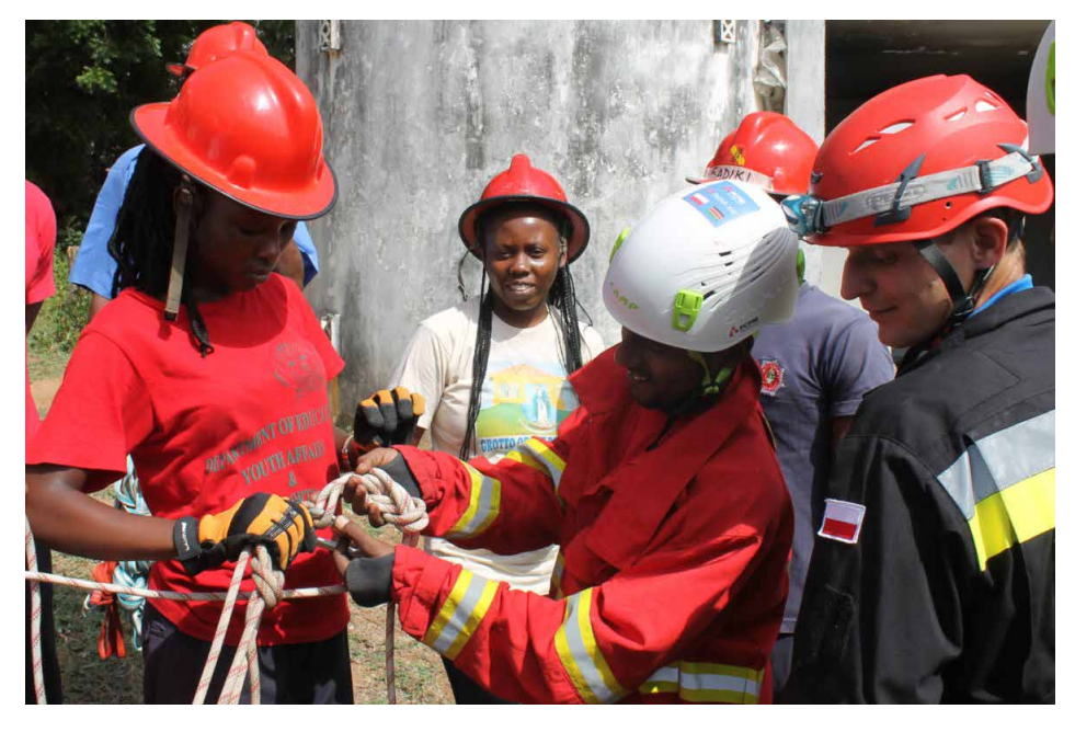
Polish Centre for International Aid's team train Kenyan firefighters. More and more women join fire service. They are full of zeal to serve their communities.