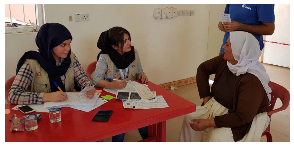
Polish Aid project "Emergency assistance and subsidiary social assistance for the most vulnerable persons in Erbil and Dohuk province", which is run in Iraqi Kurdistan.