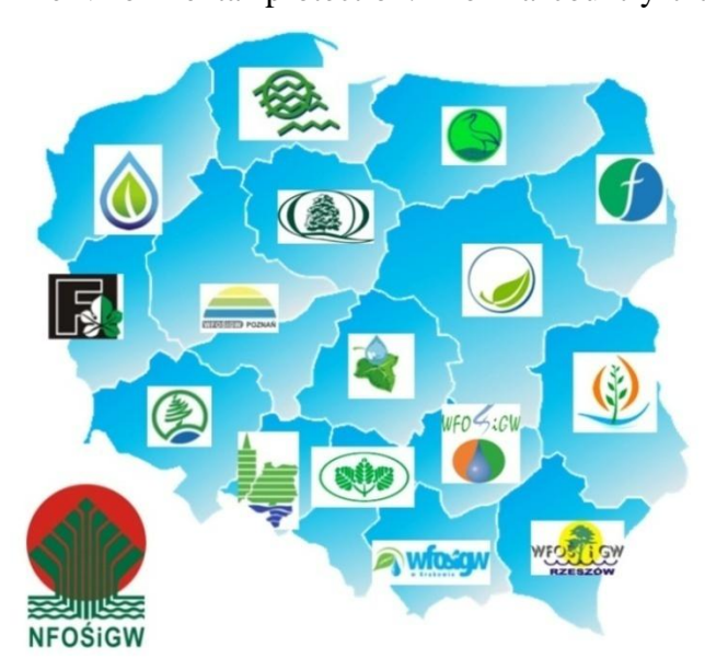
Fig. 2. The NFEPWM (NFOŚiGW) predominantly implements nationwide projects of strategic importance for the country. The implementation of tasks of regional scope in each of the 16 voivodeships in Poland is supported by the Voivodeship Funds for Environmental Protection and Water Management.

aspect of life. Modernization of the economy and socio-economic development has been accompanied by improved living conditions resulting from productive and effective investments in environmental protection. From a country that did not take into account the environmental