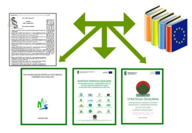
Fig. 4 The operating mechanism of the NFEPWM and VFEPWM

The number and value of projects, as well as the achieved results, have proven over more than the past two decades the institutional capability of the Funds to implement and fund a diverse range of tasks and programmes and thus confirmed the efficiency of the entire system. The Funds are fully prepared to face new challenges that – owing to the absorption of EU funds in the EU's next budget perspective 2014-2020 – should provide a developmental boost to the Polish economy and local governments in the coming years.