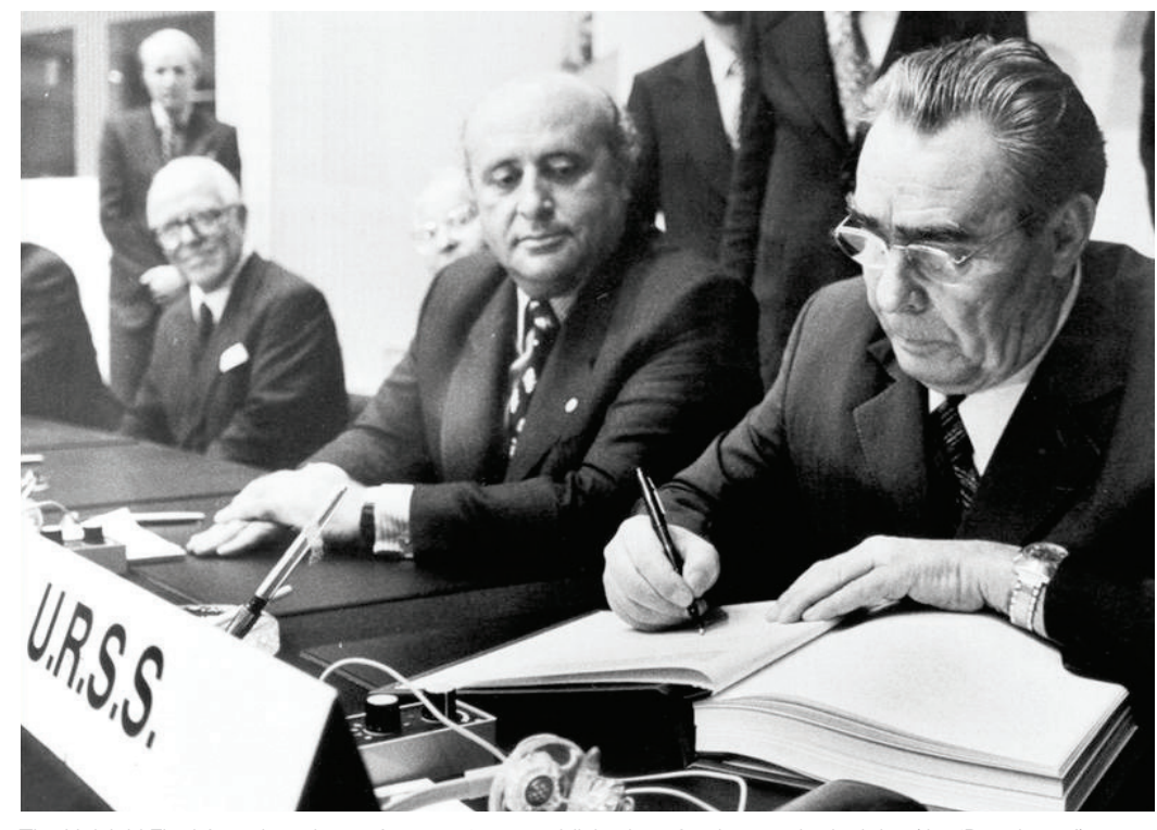
The Helsinki Final Act, signed on 1 August 1975, established ten fundamental principles (the 'Decalogue') governing the behaviour of States towards each other as well as towards their citizens. The document guides the OSCE's work to this day.

The OSCE's origins date back to the early 1970s, to the Helsinki Final Act (1975) and the creation of the Conference on Security and Co-operation in Europe (CSCE), which during the Cold War served as an important multilateral forum for dialogue and negotiations between East and West.