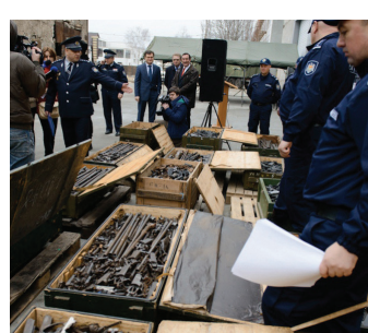
The OSCE, through its field operations, helps to stop the spread of surplus weapons and offers assistance with their destruction.