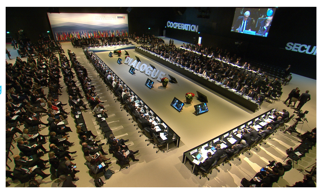
The OSCE is an intergovernmental organization in which the 57 participating States work as equals in all decision-making bodies.

Inclusiveness underpins everything the OSCE does. OSCE participating States enjoy equal status and take decisions by consensus.