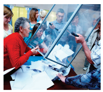
The OSCE observes elections, and advises governments on how to develop and sustain democratic institutions.