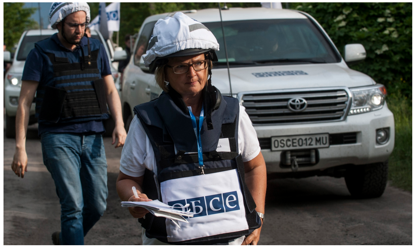
The OSCE's work on the ground enables the Organization to tackle crises as they arise. The OSCE has deployed hundreds of monitors to Ukraine with the aim of reducing tensions.

With 57 participating States in North America, Europe and Asia, the OSCE – the Organization for Security and Co-operation in Europe – is the world's largest regional security organization. The OSCE works to build and sustain stability, peace and democracy for more than one billion people, through political dialogue and projects on the ground.