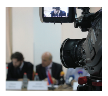
Independent and professional media are a cornerstone of democratic societies, and a key focus of the OSCE's work.