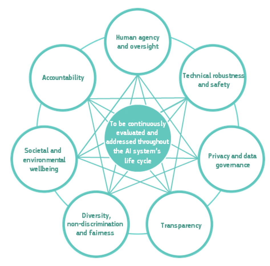
Figure 2: Interrelationship of the seven requirements: all are of equal importance, support each other, and should be implemented and evaluated throughout the AI system's lifecycle

While all requirements are of equal importance, context and potential tensions between them will need to be taken into account when applying them across different domains and industries. Implementation of these requirements should occur throughout an AI system's entire life cycle and depends on the specific application. While most requirements apply to all AI systems, special attention is given to those directly or indirectly affecting individuals. Therefore, for some applications (for instance in industrial settings), they may be of lesser relevance.