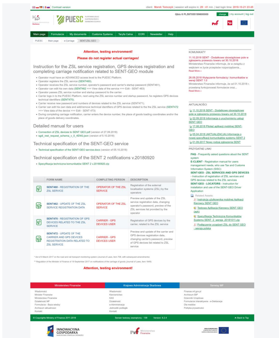
Fig. 3. Screen with forms for ZSL

In the right part of the screen, click on the SENT-GEO tab - SERVICES AND ZSL DEVICES - Instructions for registering ZSL services and GPS devices related to the ZSL services . Another window containing forms for ZSL is opened (Fig. 3).