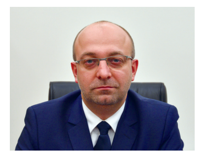
Łukasz Piebiak, Undersecretary of State