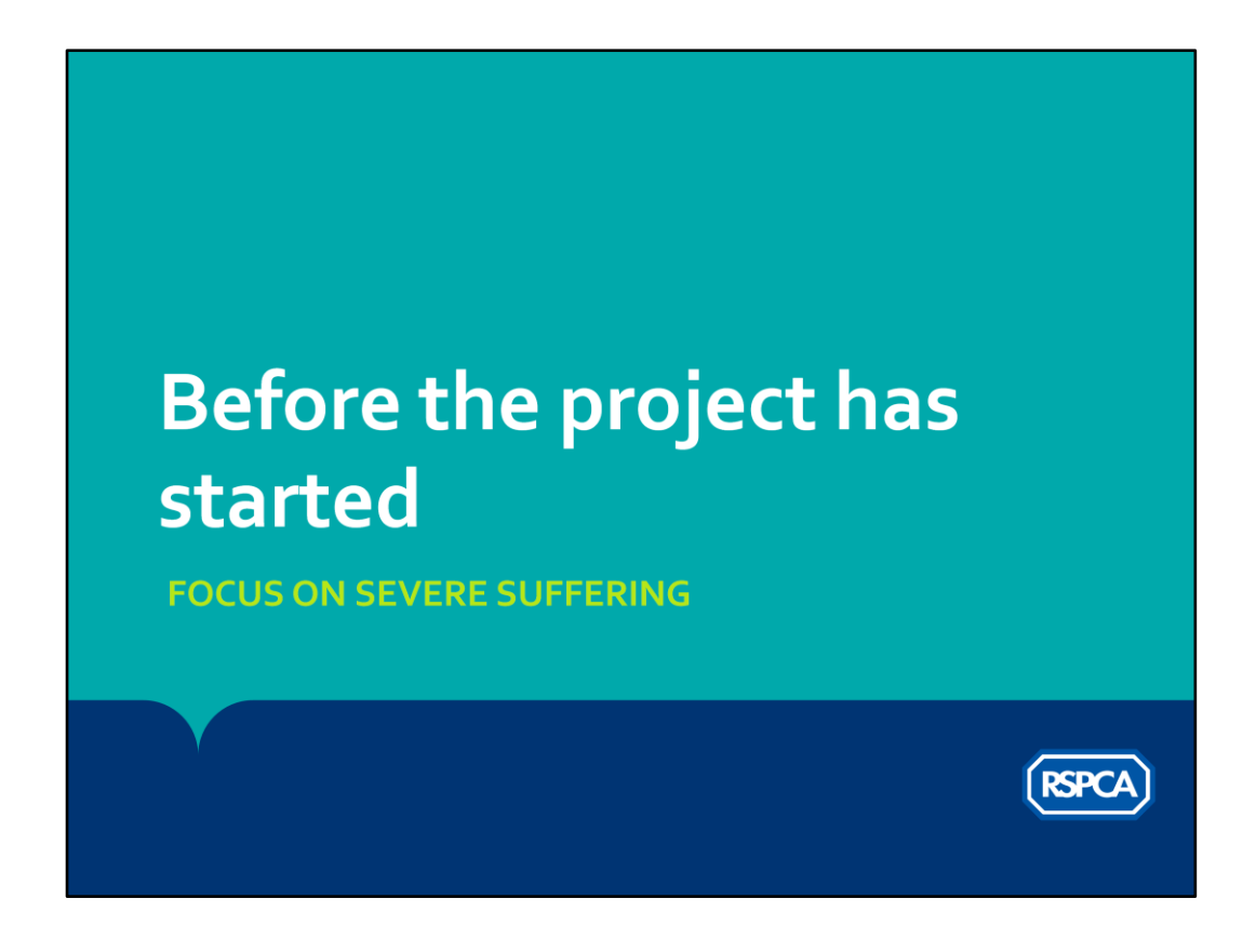
Slide 2.1 Reviewing procedures that have the potential to cause severe suffering

This series of slides aims to guide the AWERB (or other review body) through a review of potentially severe procedures, to see whether severity can be reduced.