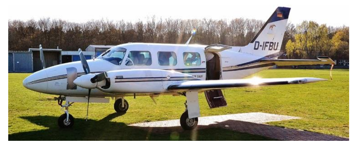
Figure 14. PA-31, D-IFBU airplane prior to the accident.