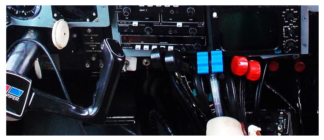
Figure 8. A section of the instrument panel. Visible: the landing gear control lever (white) in the up position ("gear retracted"), the levers of throttles (black), propellers pitch (blue) and composition of the air-fuel mixture (red) in the forward positions – full power.

The instrument panel was extracted from its mountings and displaced in the direction of the seats, but board instruments had no visual signs of damage (Figure 7). Visual inspection of the instrument panel showed among other things, that the landing gear control lever was in the up position ("gear retracted"), and the levers of throttles, propeller pitch and composition of the air-fuel mixture were in the forward position, as shown in the photo below (Figure 8).