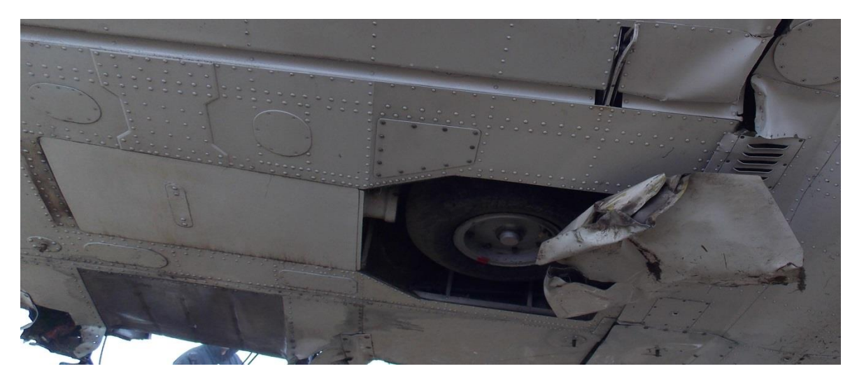
Figure 12. The left main landing gear after the accident – "gear retracted". The inner door of the wheel well deformed and not fully closed due to the collision with the aerodrome surface. The outer door closed.