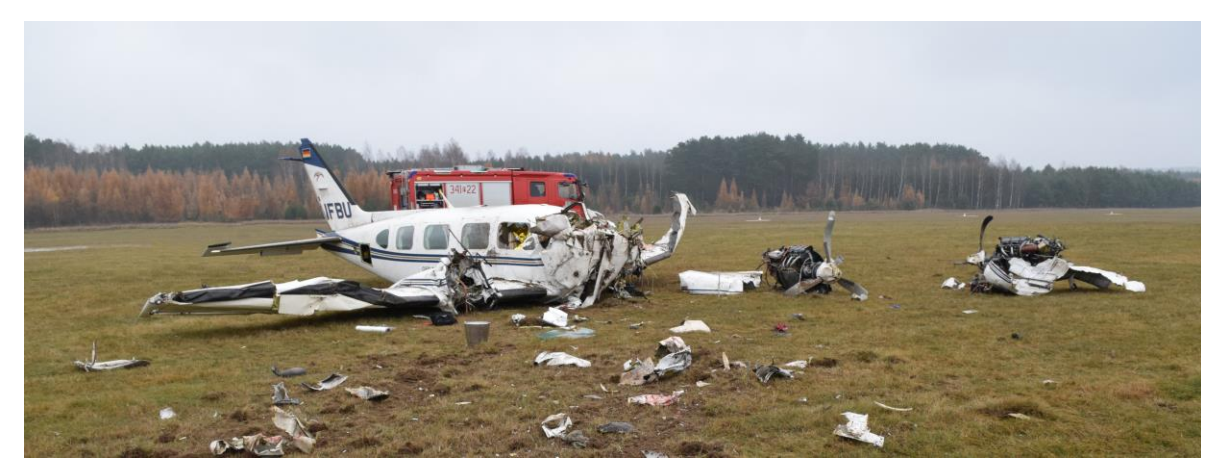
Figure 5. The airplane at the scene directly after the accident. The engines are on the right. The right engine is closer to the airplane the left one is farther.

After several dozen meters of the take-off run the plane lifted-off with the left bank and from a height of over a dozen meters, rolling to the left, collided with the ground. The left wing tip and the left engine contacted the ground and later the nose part of the fuselage, the right engine and right wing also contacted the ground.