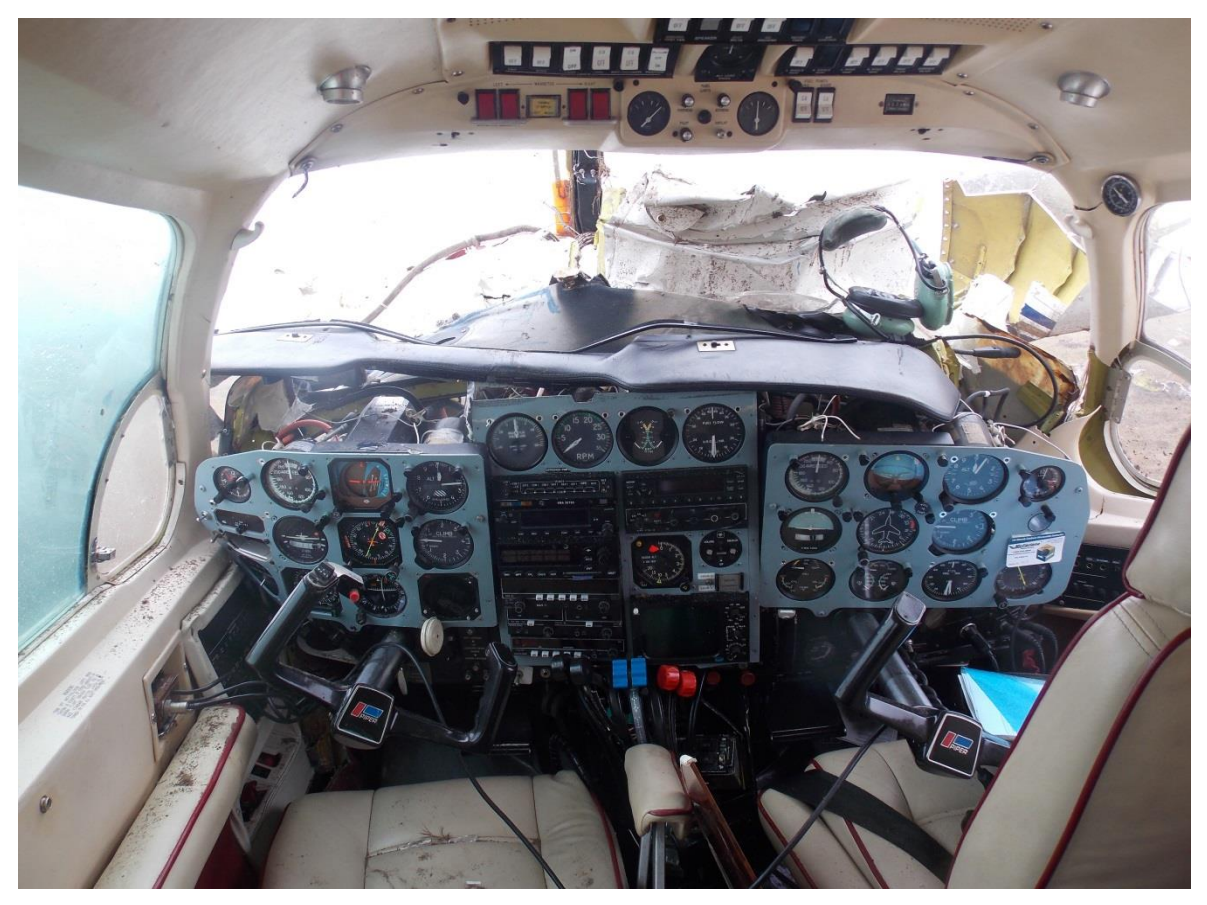
Figure 7. Condition of the instrument panel after the accident.