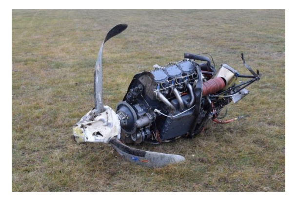
Figure 6. The above photo shows the condition of the left propeller blades ("tulip"). The right photo shows the less deformed blades of the right propeller.

contact with RWY during the take-off run. The blades of the right propeller, except one, were much less deformed because they did not penetrate so deeply into RWY surface and when the right wing went up, they lost contact with the ground.