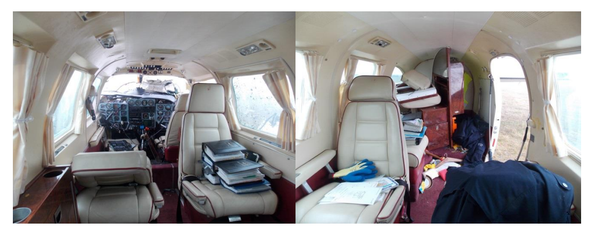
Figure 9. The cabin after the accident. Photo on the left was taken in the forward direction and shows lack of pilot's seatback which was removed during rescue operation. Photo on the right was taken in the backward direction.

The cockpit condition is shown in Figure 9. The photo was taken next day after the accident. Dislocations of some items in the cockpit are not excluded. They resulted from rescue and protective operations.