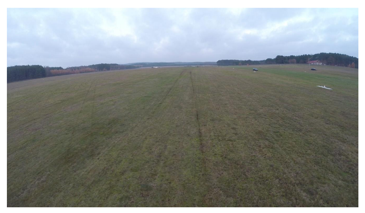
Figure 1. First tracks of the main landing gear left on RWY 06 grass after the take-off run.

At about 12:05 hrs the airplane started the take-off run. The course of the run was recorded from the aerodrome tower until the accident. A sketch of the take-off run is shown in Annex 1 to this Report. The first tracks of the main landing gear on the surface were found about 500 m from the threshold of RWY 06 (Figure 1, below).