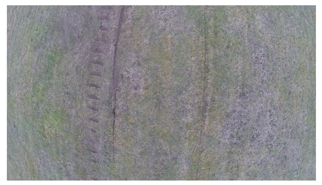
Figure 4. Traces on RWY 06 in the final phase of the take-off run. On the left visible a deep print of the inner door of the left wheel well and a trace of the left propeller. On the right only a disappearing track of the right wheel is visible.

After several dozen metres of the take-off run the left wheel well door also touched the ground leaving a deep track on the grass (Figure 4). The right wing went up and only a disappearing track of the right wheel was left on the RWY surface. The right propeller lost contact with the RWY surface.