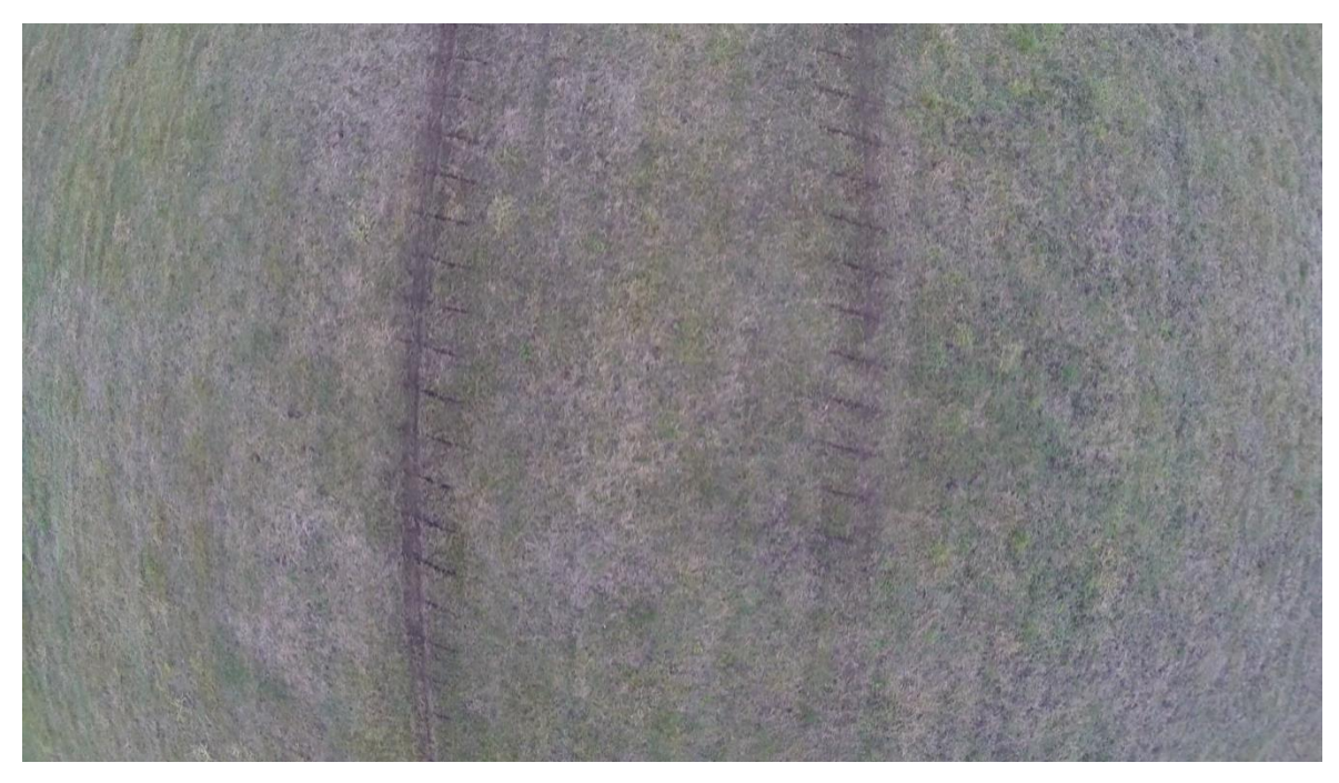
Figure 3. Traces of the main landing gear and both propellers. Visible traces of the propellers collision with RWY 06 surface, but lack of the nose wheel track indicates that the nose landing gear was in the final phase of retraction.

Due to the fact that the left main landing gear was retracting faster than the right one, the airplane was rolling to the left and the left propeller went down earlier (visible deep prints in the grass) than the right one.