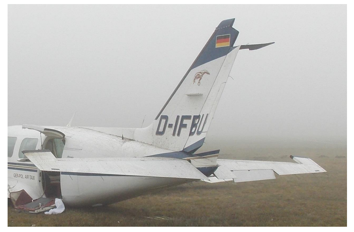
Figure 10. Damage to the upper part of rudder. Visible the bent upper part of rudder with aerodynamic balance.

The horizontal empennage did not show any signs of damage but the upper part of rudder with aerodynamic balance was bent by about 90 degrees. This is shown in Figure 10.