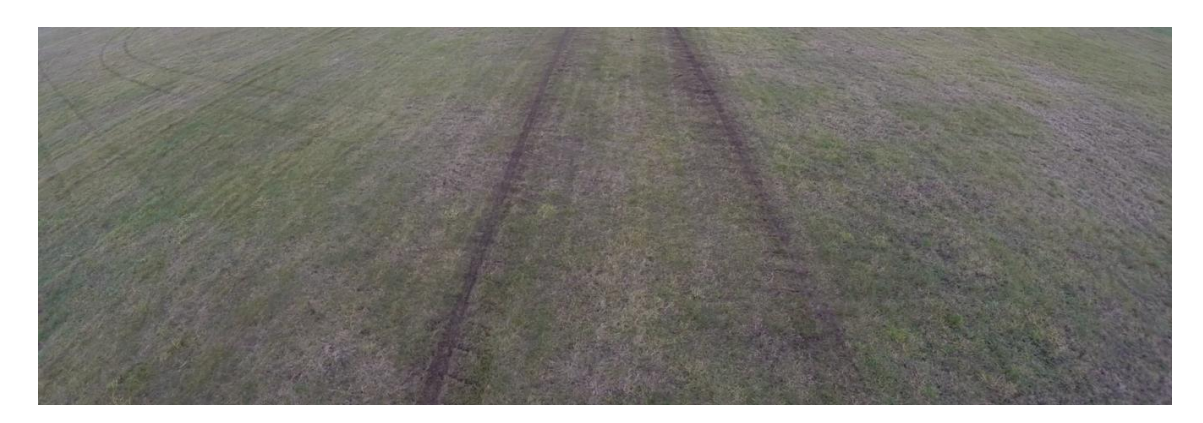
Figure 15. Wheel tracks and propeller traces in the middle part of RWY 06/24 after take-off run.

The active part of RWY 06/24 is a grassy surface of 950x180 m. The hardness of the RWY surface changes along its length, particularly in the middle, where the land is lower and after precipitation a local decrease in bearing strength of the surface may occur (Figure 15 below).