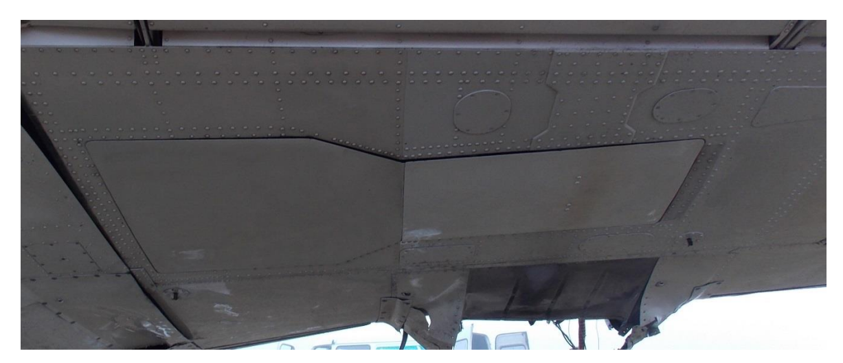
Figure 11. The right main landing gear after the accident – "gear retracted", both doors of the wheel well "closed".

A visual inspection of the wreckage at the scene showed that both the main and the nose landing gears were retracted and the wheel well doors were closed.