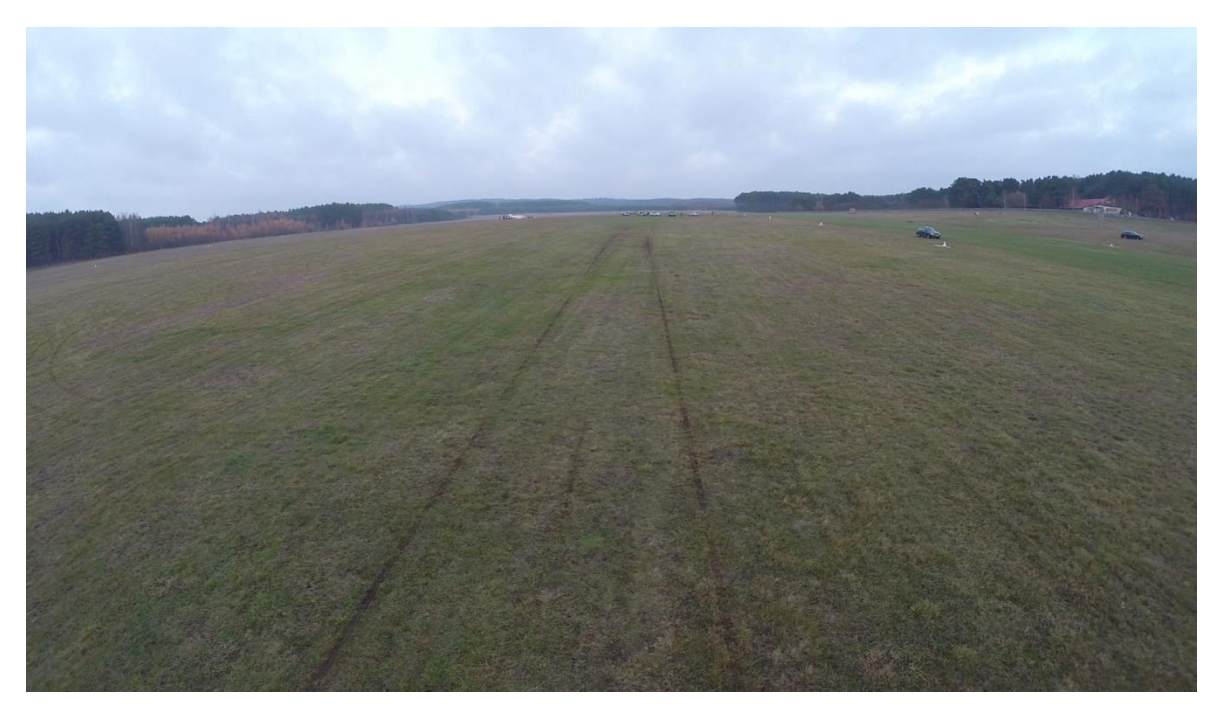
Figure 2. First track of the nose landing gear on RWY 06 grass.